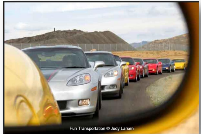
Fun Transportation © Judy Larsen

Please send photos of interest group activities to Stephanie Brown for archives and Thumb Sketch