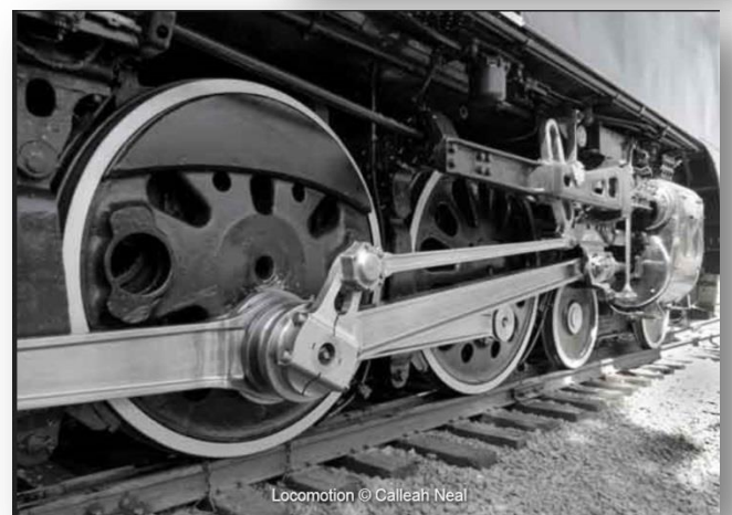
Locomotion © Calleah Neal