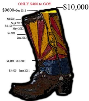
AAUW Centennial Scholarship Fund