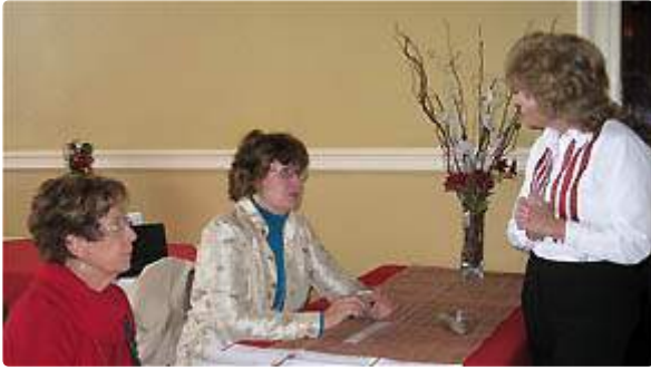
The welcome desk.