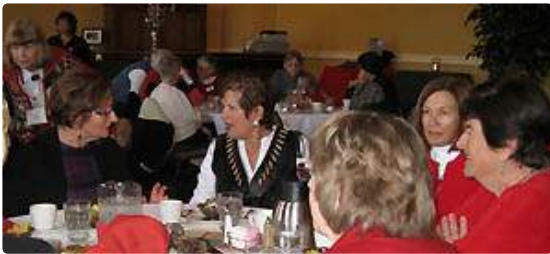
Brunch is served.