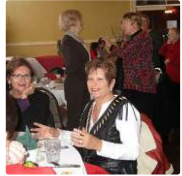
Chatting with AAUW friends.