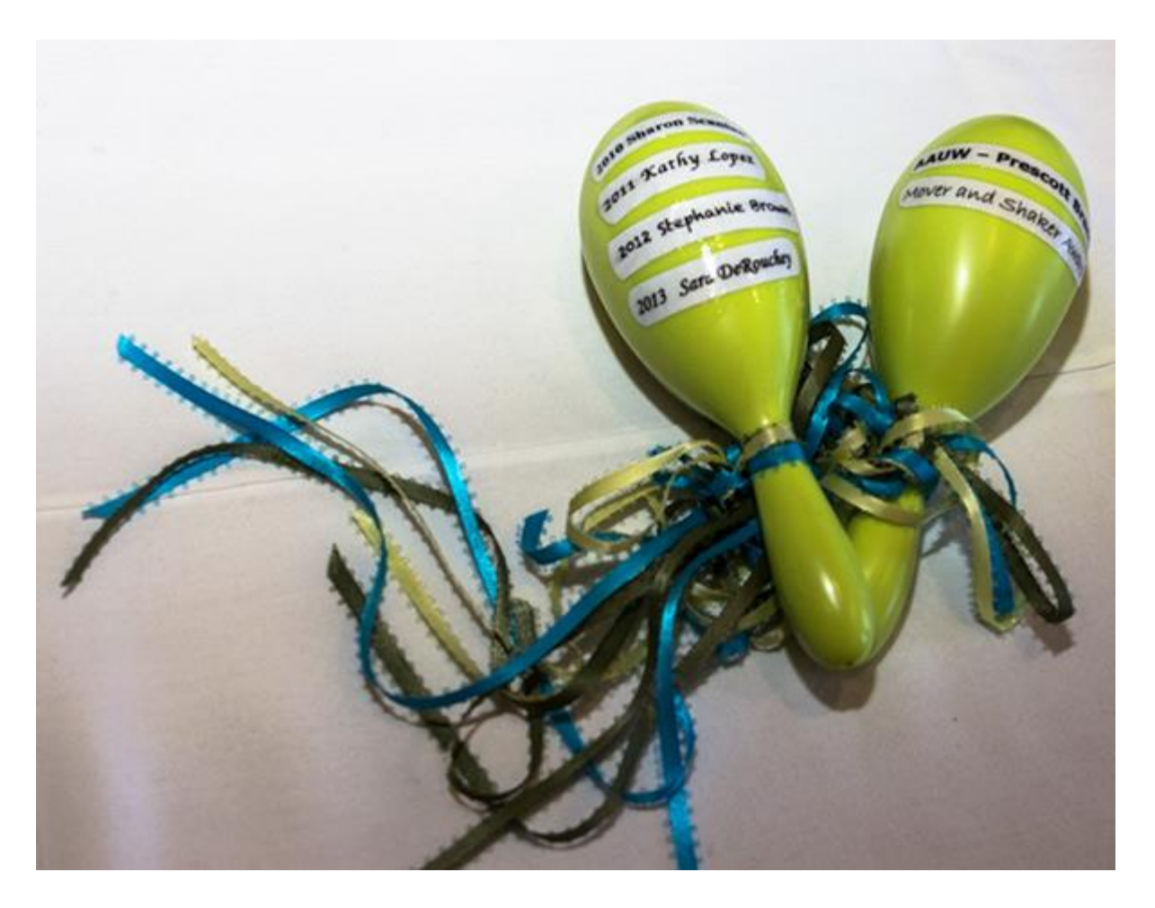
Mover & Shaker- for members who have belonged to our branch for more than 3 years and exhibit personal integrity, leadership, initiative, sustained dedication to the Mission of AAUW, and personal growth opportunities within the membership.